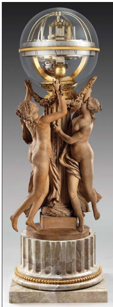
Movement by Jean-Baptiste Lepaute, sculpture by Claude Michel Clodion, The Dance of Time, Three Nymphs Supporting a Clock , 1788, terracotta, gilt brass, and glass.