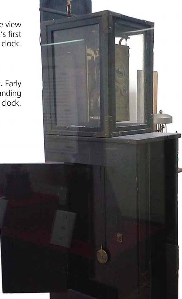
Figure 6, far right. Early Japanese floorstanding

Traditional Japanese clocks indicated the hours according to the old system of 6-day and 6-night hours, lengthening and shortening seasonally. Some featured adjustable sliding hour indicators; others switch daily between two foliot escapements. Examples of both methods could be viewed at the museum. This system lasted until 1873 when Japan converted to the European method of 24 equal hours per day. Striking also was different with hours counted on bells ringing from nine to four, with nine dings announcing midnight and noon. These clocks appear occasionally at auctions in this country (Figures 6 and 7); several were offered at the Skinner auction in Marlborough, MA, this past April. The article about this auction