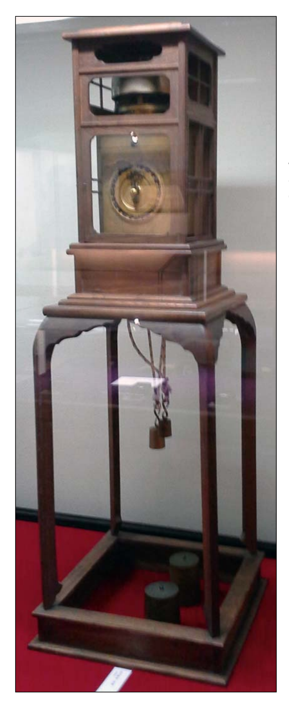
Figure 7, left. Early weight-driven Japanese clock with foliot escapement.