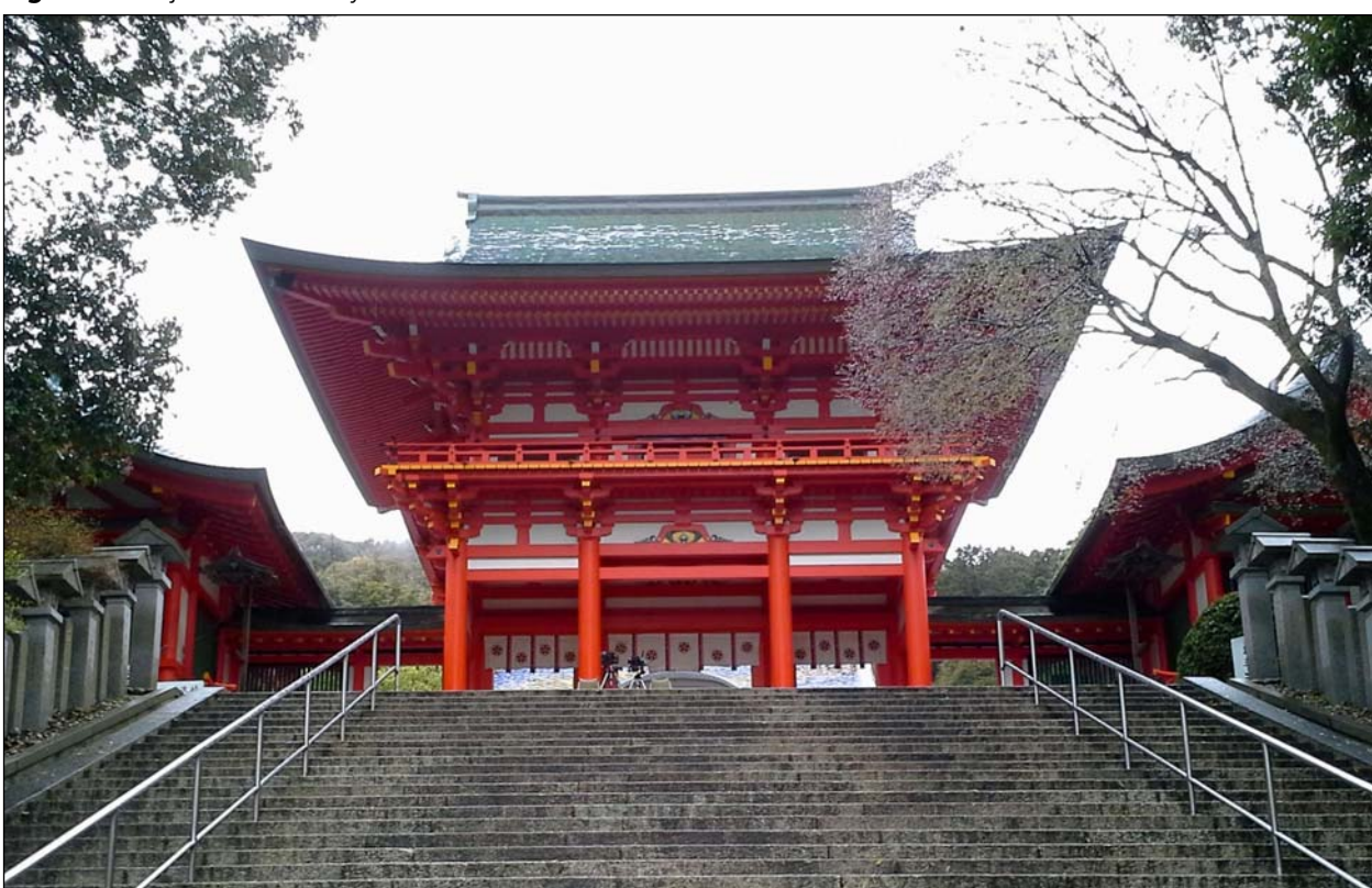
Figure 1. Tenji shrine near Kyoto.

Bronner provided his English versions of some of the informative signs and labels.