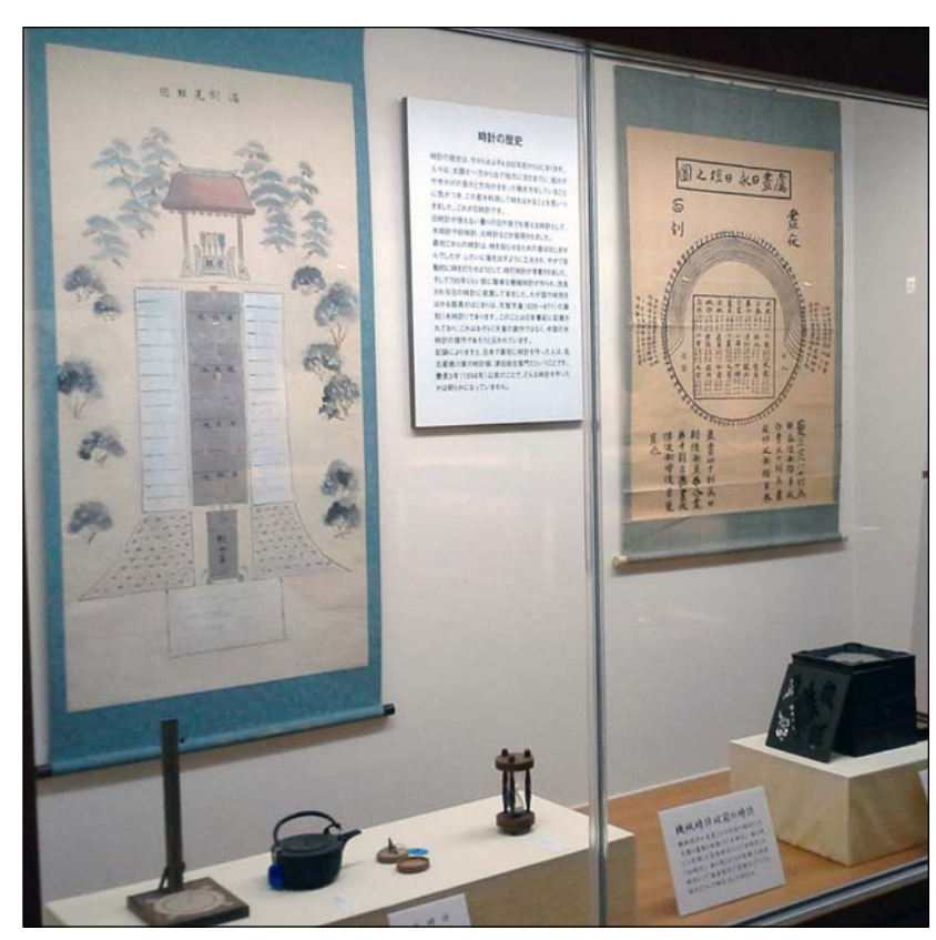
Figure 4. Display case in the Omi Jingu Clock Museum.

Figure 5, right. Side view of reportedly Japan's first pendulum-regulated clock.