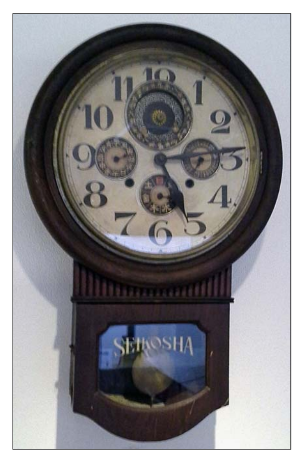
Figure 8. Seikosha multidial wall clock.

enance. I have repaired many of these for owners who thought they had an American clock. I pointed out to them the basic brass two-train movements that are nearly identical to Connecticut clocks of the same period.